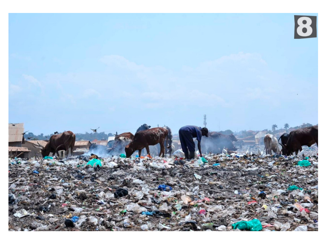
Figure 1. Garbage and Livestock (photo number 8).