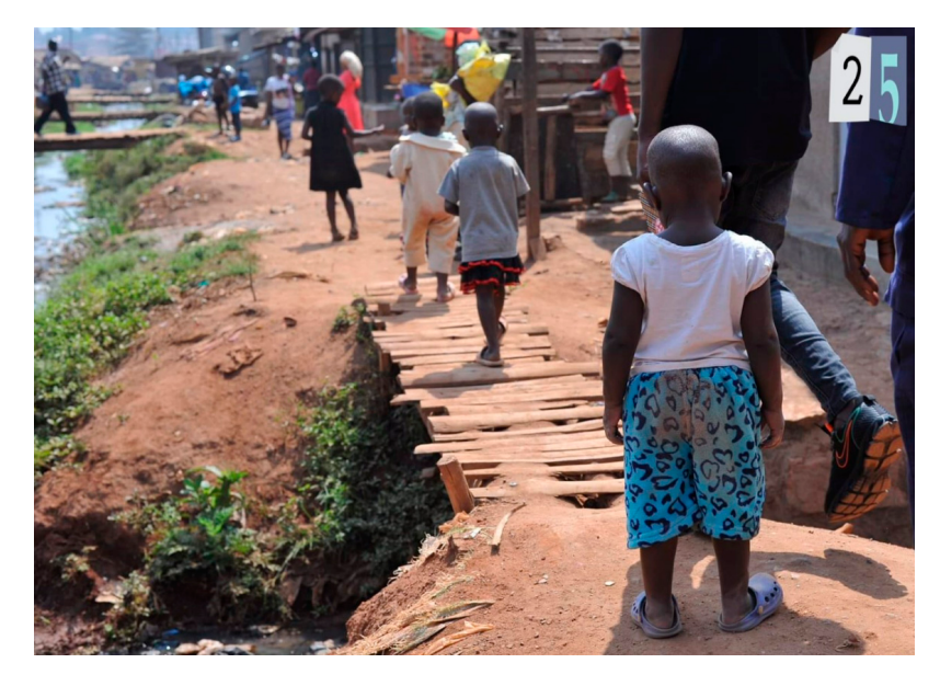
Figure 3. Children Walking over Bridge (photo number 25).