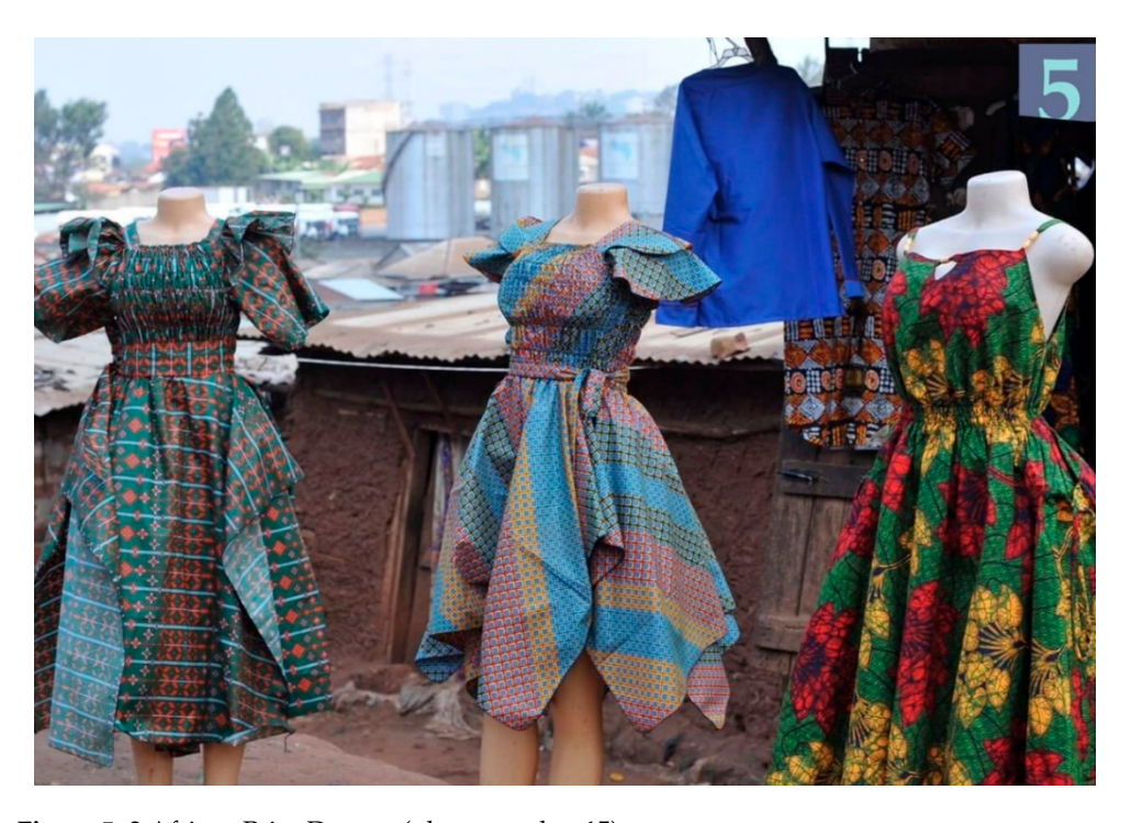
Figure 5. 3 African Print Dresses (photo number 15).

Four photos specifically elicited a response of happy and depicted a scene with three African print dresses (Figure 5), a mosque, a medical clinic, and a photo of a prevention message on a mural wall (Figure 6).