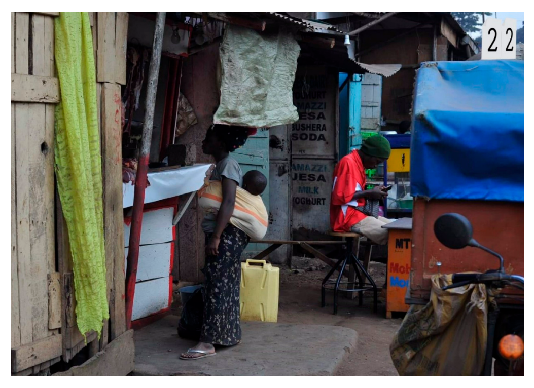
Figure 7. Mother With Child Shopping (photo number 22).

One photo depicted all three emotions and reflected a young woman with child shopping for food (Figure 7).