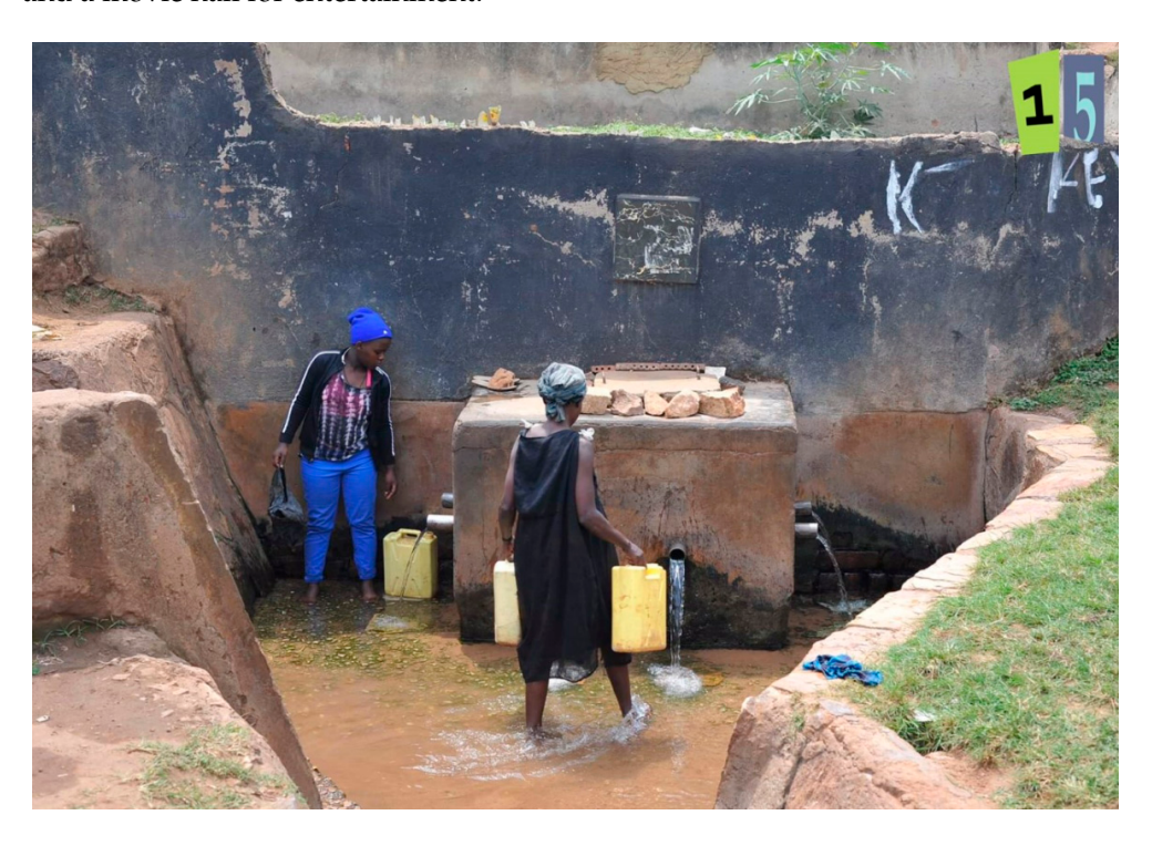
Figure 4. Women Fetching Water in a Well (photo number 15).

Four photos reflected multiple emotional responses of happy and sad, and depicted the weekly market, women entrepreneurs cooking, women fetching water in a well (Figure 4), and a movie hall for entertainment.